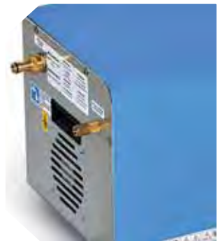
Detail of the intake of the cooling fan