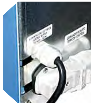
Detail of the side for the connection to an external device (such as: thermostat or others).