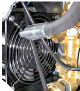
View of the cooler fan of VENTILATO 60 bar-850 psi fog module.