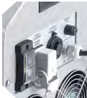
Detail of the control panel, with cooling fan and connection to the remote control of fog 100 Ambiente