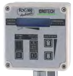
The "heart" of fog 100 Ambiente. The new software by Idrotech