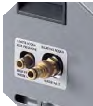
Detail of the water inlet and outlet of the fog module 100 Ambiente