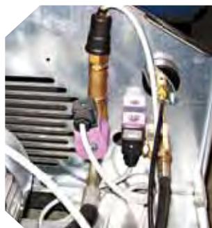
Detail of internal fog module, solenoid valves and electric motor air intake