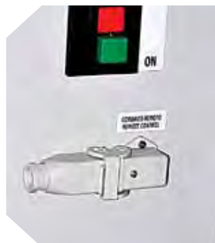
Basico 70 bar fog module, detail of the side fog module equipped with a connector to insert an external device such as thermostat, humidistat and others.