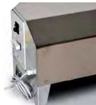
Basico 70 is available also in stainless steel version (head pump, solenoid valve, by-pass).